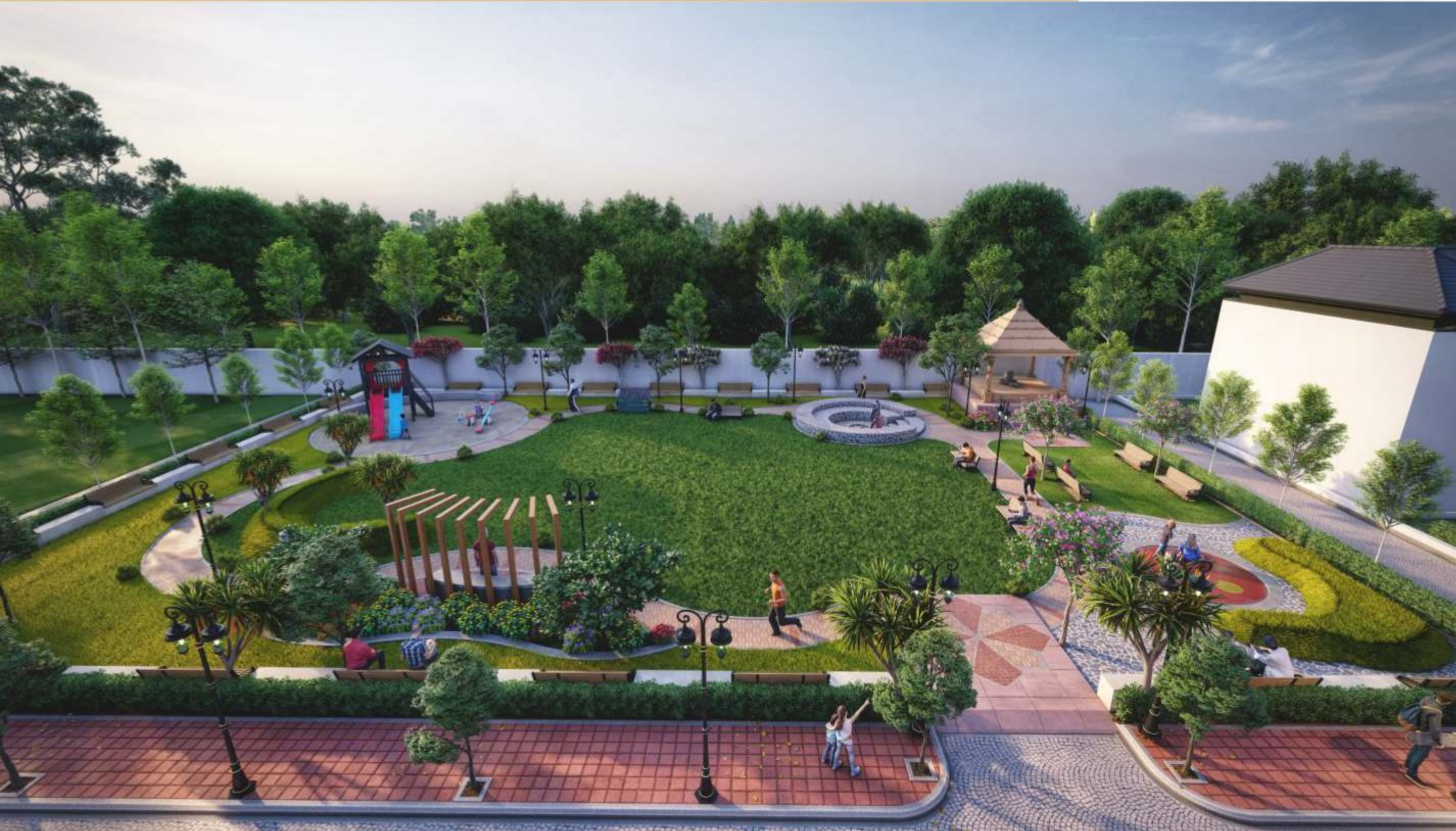
Above: Artistic Visualization of landscaped garden at Samridhi Residency gated development