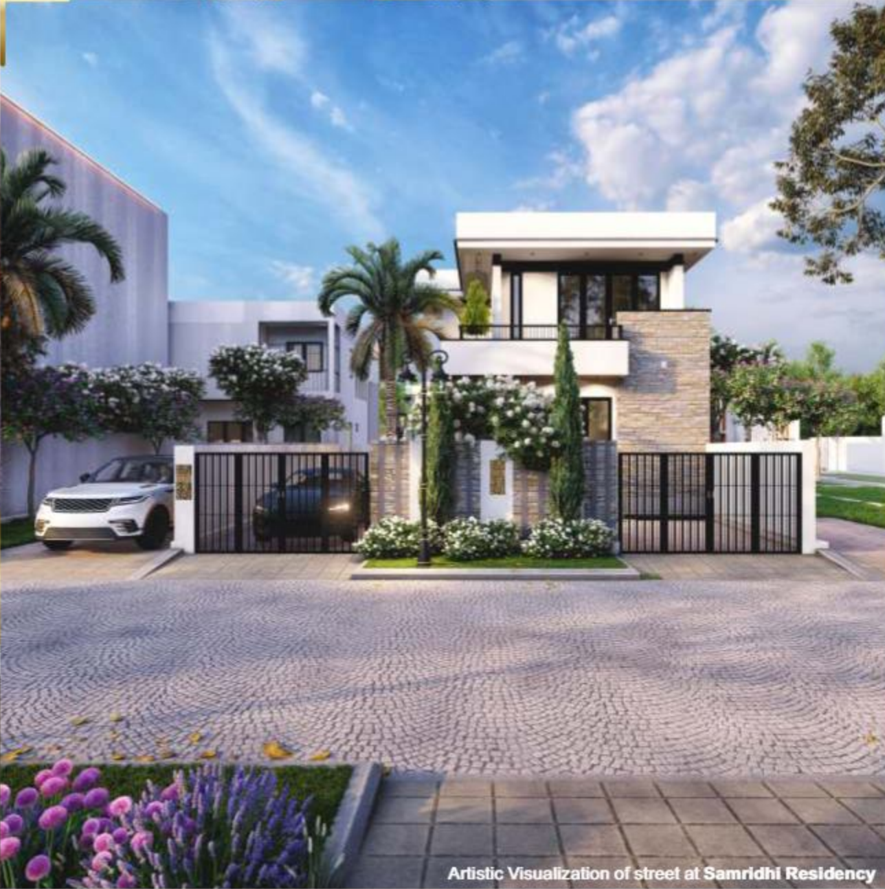
Artistic Visualization of street at Samridhi Residency

Samridhi Residency is where modern living seamlessly blends with lush nature within an unparalleled master plan, creating a life abundant in infrastructure, lifestyle, nature, and connectivity.