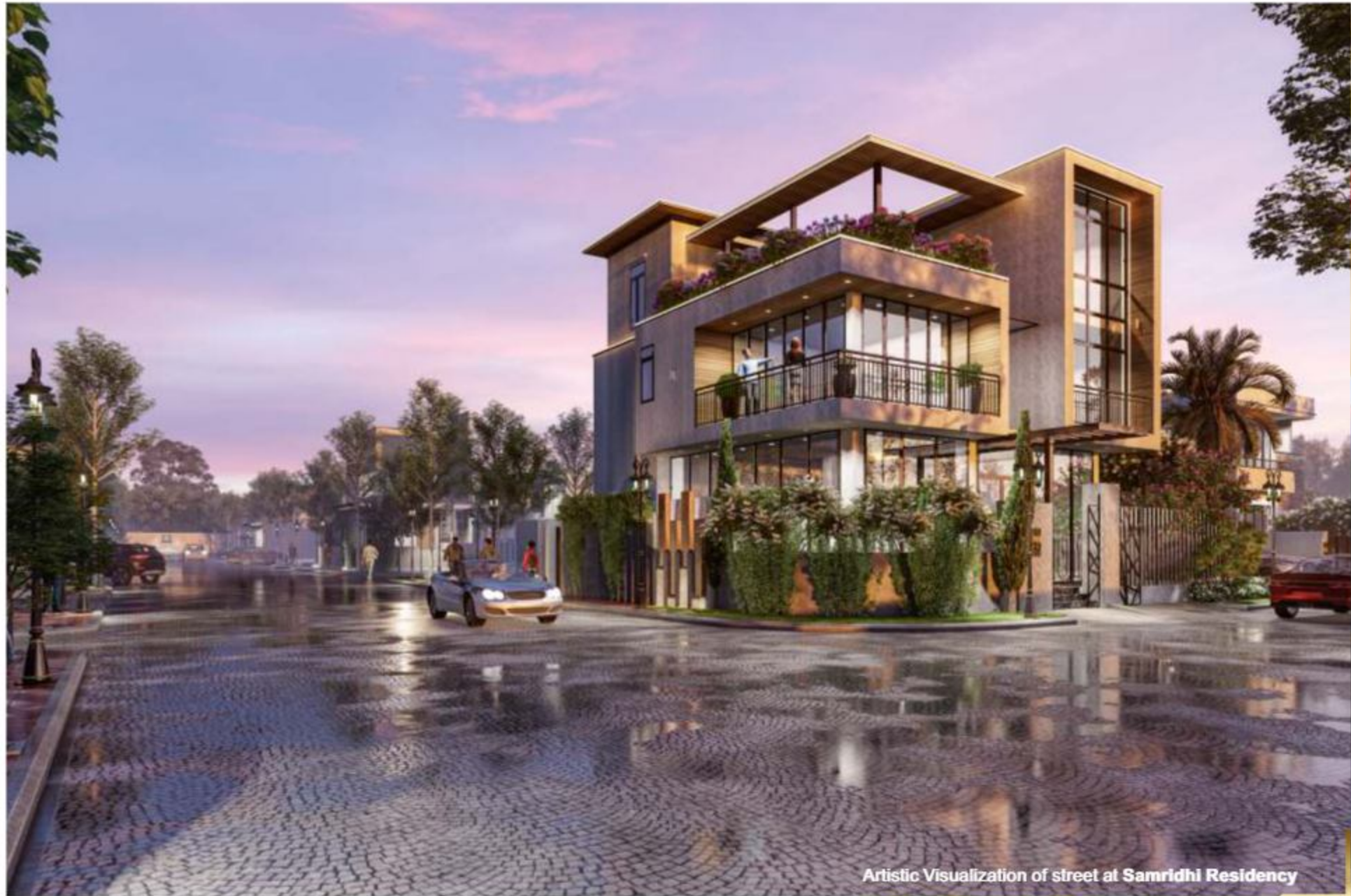
Artistic Visualization of street at Samridhi Residency