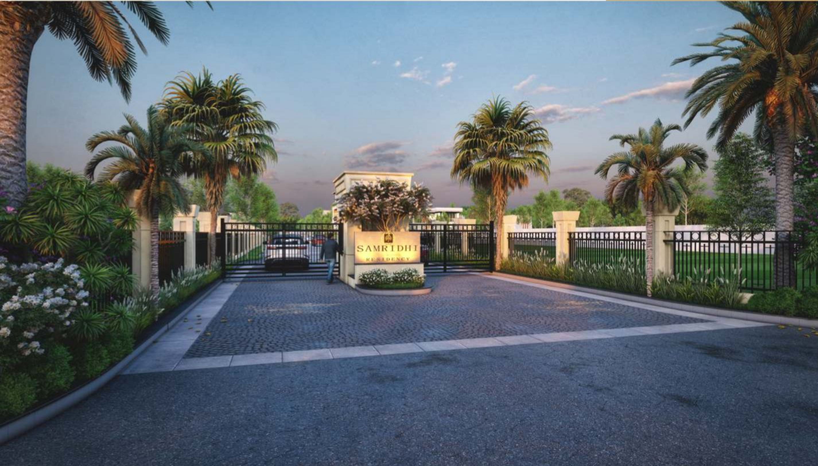
Above: Artistic Visualization of street at Samridhi Residency gated development