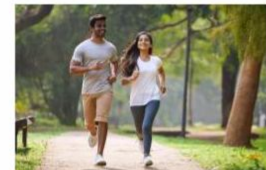
STAY FIT IN LANDSCAPE PARKS