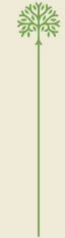
Graphic Representation of Site Layout at Samridhi Residency