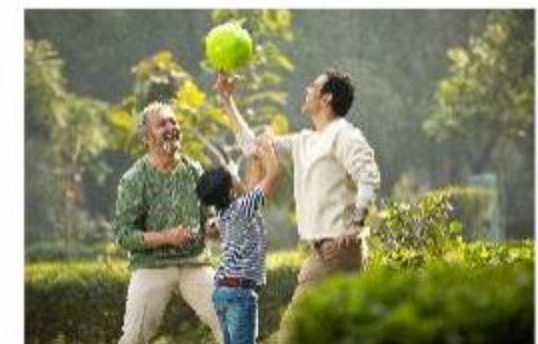
FREE OPEN SPACES TO PLAY SAFE